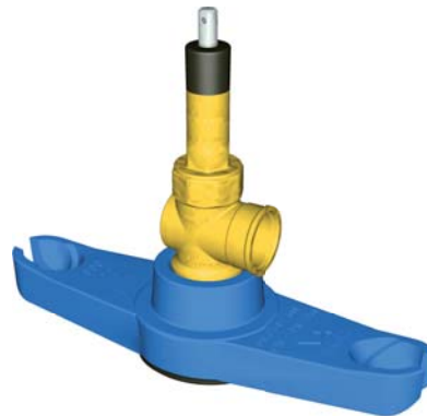
Model 02.03.01 Art. no.: 02.03.01.11

UNI - VAS with GGG - corner valve Rp2" Tapping system with ball auxiliary valve