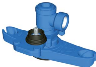
Model 02.03.06.IG Art. no.: 02.03.06.11.IG

UNI - VAS - SST with SST - DAV trapezoidal thread Tapping system with integrated thrust slide disk