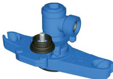
Model 02.03.06.TG Art. no.: 02.03.06.11.TG

UNI - VAS - T with pivot-mounted tapping tee Outlet Rp 1½" Tapping system with integrated thrust slide disk