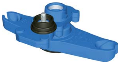
Model 02.03.05.IG Art. no.: 02.03.05.11.IG

UNI - VAS with brass corner valve Rp 1½" "Union" tapping system with piston valve